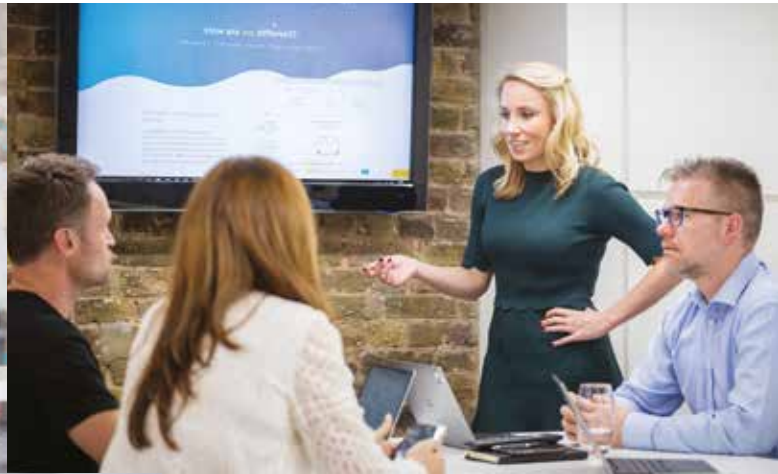
Above Employee wellbeing is a company priority Left Happy employees make for happy customers